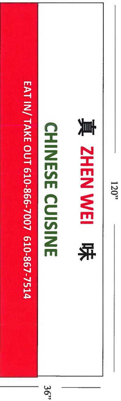
Exhibit I: Box Light